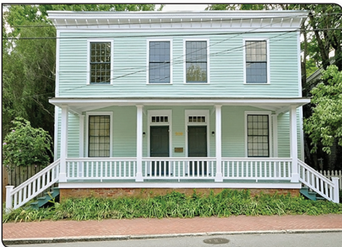
Lynne Splinter Realty sold this 3 bedroom, 2.5 bathroom Carroll Street house for $300,000

He's also seen inventory going down which explains some of the new home construction going on down the street on North