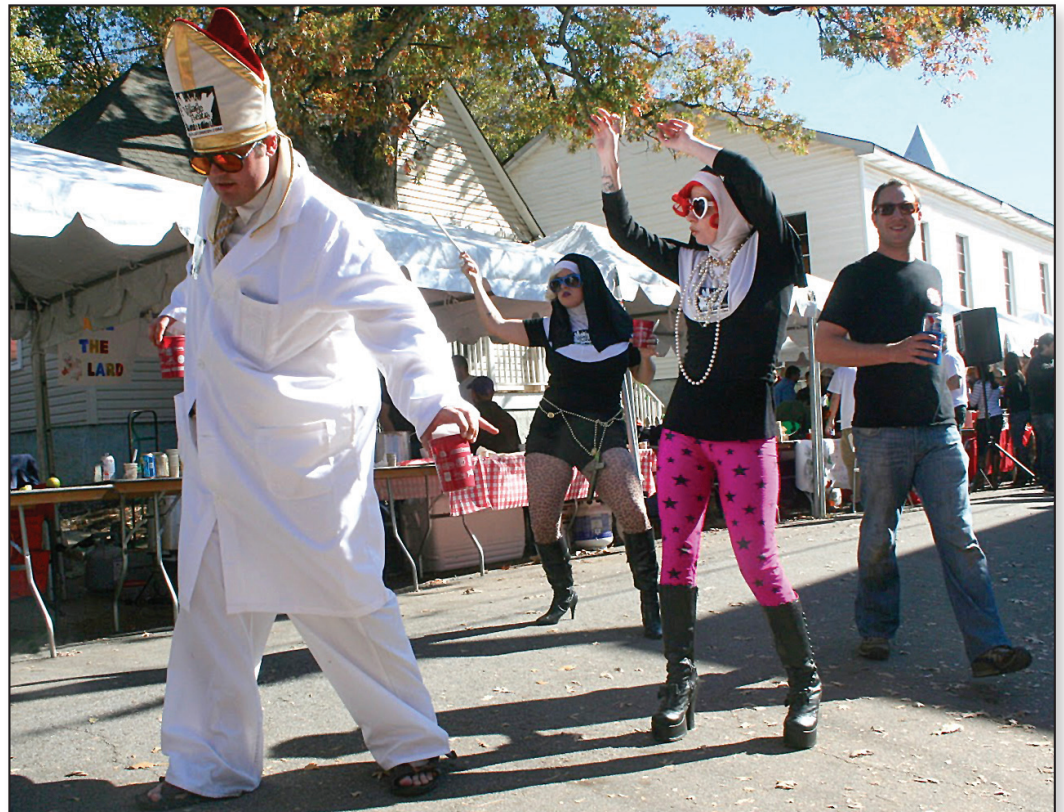
Chomp and Stomp 2011.

The Community Center is located at 177 Estoria Street. If you have an item to add to the agenda, please email cniaboard@gmail.com .