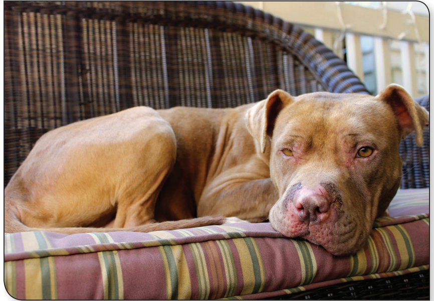
EDITOR'S NOTE: This editorial submission is meant as satire. No disrespect towards rednecks, the Deep South, our educational system or pit bulls is intended. The pit bull and the mailman were not harmed during this photo shoot.

That's The Entry Enforcer – a sure shot for home protection.