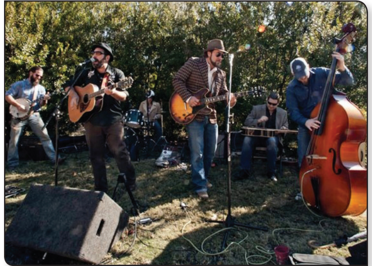
Rolling Nowhere at Chomp and Stomp 2011.

The website: www.CHOMPANDSTOMP.com is now open for applications for Artists, Vendors, Chili Cookers, and Restaurants.