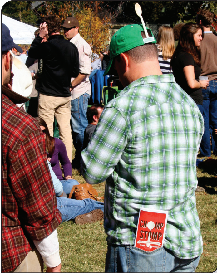
Chomp and Stomp 2011.