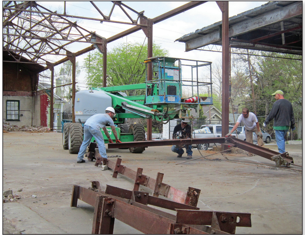
Destruction and construction continues at the new Krog Street Market.