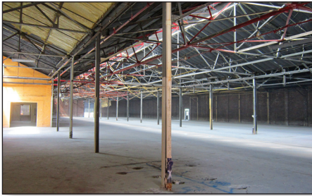
April 2013 Interior photo of Krog Street Market.

"Successful people are very lucky. Just ask any failure." - Urban Meyer