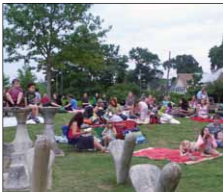
Cabbageheads gather in Cabbagetown Park for "Movie Night in the Park".

Big thanks to the following sponsors for making Cabbagetown a great place to live: Sweet Cheats, Wag-A-Lot, Six Feet Under, Bryan Brunson Law, CFYC, Small Planet Foods, Cayrum, 97 Estoria, GS4URents, and Mt. Hermon Baptist Church.