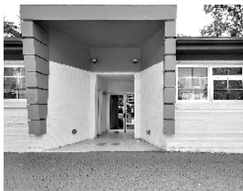
CARROLL STREET LOFT CLOSED in 63 days!