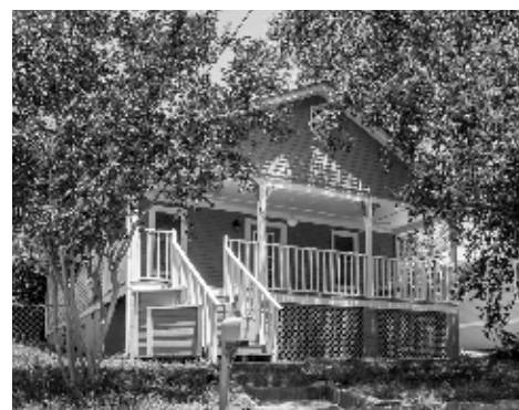
608 GASKILL ST. SE UNDER CONTRACT!