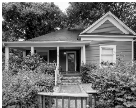
219 POWELL ST. SE SOLD before hitting the market!