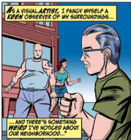
*THAT'D BE CABBAGETOWN...