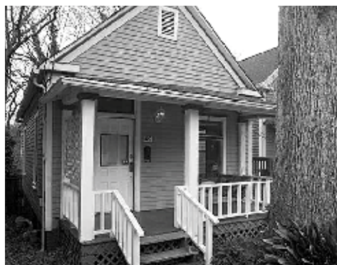
169 POWELL ST. SE CLOSED in 66 days!

No need to wait on recovery – it is alive and well in Cabbagetown! If you are thinking of selling – now is the time. Call us for your market analysis – we are getting top dollar with speed! We would love to guide you with your purchase as well – things are moving fast and knowing how to approach your offer is crucial. For additional buying and selling resources check out CabbagetownChronicles.com or contact Chrissie directly at 404.295.2068/ chrissiekallio@gmail.com .