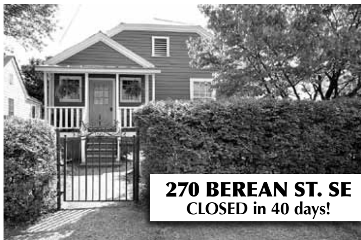
270 BEREAN ST. SE CLOSED in 40 days!

Don't miss the heat wave – contact Chrissie Kallio now!