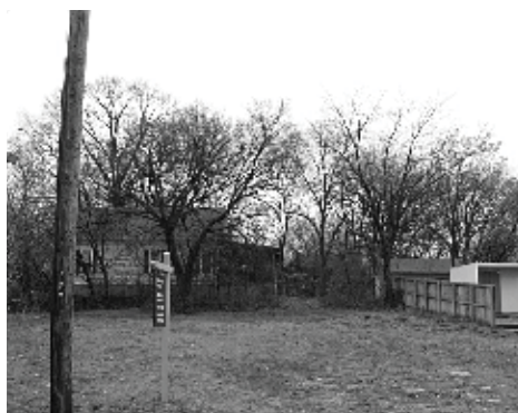
184 PEARL ST. SE 2 Lots CLOSED in 43 days!