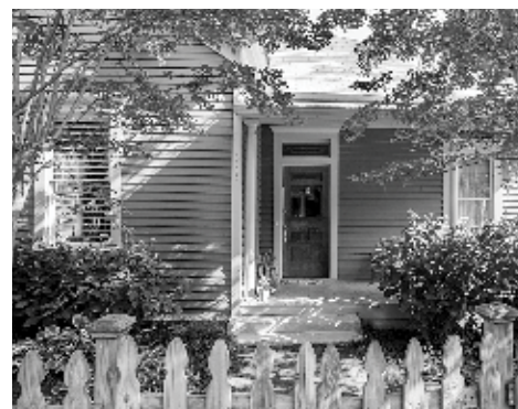
685 WYLIE ST. SE CLOSED in 48 days!