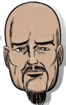
THE "MONGOL HORDE"