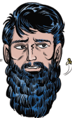
"BEARD OF BEES"