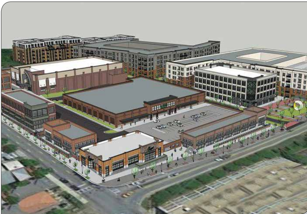
Architectural rendering of Madison Yards, by Fuqua Development.

The streets nearest this area – Chester, Selman, Oliver (now Kenyon), and Wylie – were the very first ones to be settled and were known as Tin Cup Alley and later, "The Slide" because of the muddy conditions there. The area grew into a vibrant community around 1870 and became known by its present name: Reynoldstown.