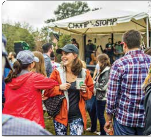
The party that was. Chomp and Stomp 2015.

Pretty soon over 20,000 folks will be streaming through our streets looking for a place to park and wanting to know where to buy those chili spoons and Cabbagetown Cookbooks. Mark the date on your calendar for Saturday, November 5 th 11a to 6p. Location is Cabbagetown Park, Esther Peachy LeFevre Park, and the surrounding streets.