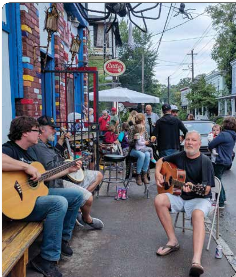
September 12 th , 7:15p. Little's Food Store.

Even the winter storms of 1982, 1993, 2000, and 2014 didn't do the damage or dim the lights like Tropical Storm Irma. On Monday, September 11 th , Irma's fury swept into Cabbagetown bringing 50mph wind gusts, upwards of five inches of rain, and claimed three lives throughout Atlanta.