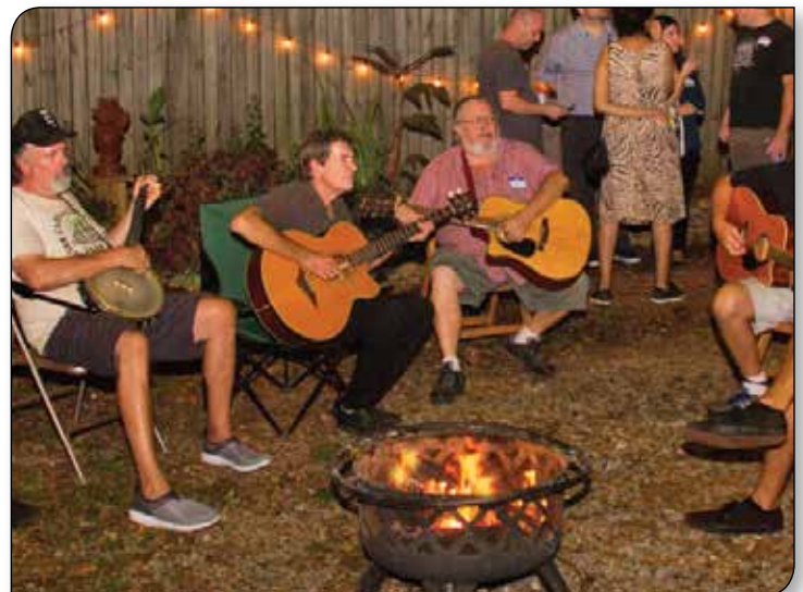
Just another Friday night in Cabbagetown.