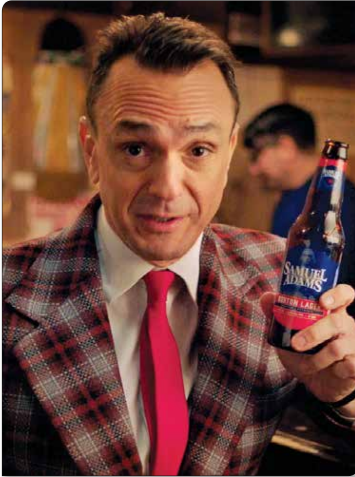
Hank Azaria as Brockmire

IFC network television series "Brockmire" will be filming scenes in our area on Monday Oct 2 nd 2017. They will be working from 5a until 8p in order for them to stage their equipment vehicles and to be mindful of public safety matters, the production will be permitted for the following street closure: Carroll Street – between Gaskill Avenue and Savannah Street SE.