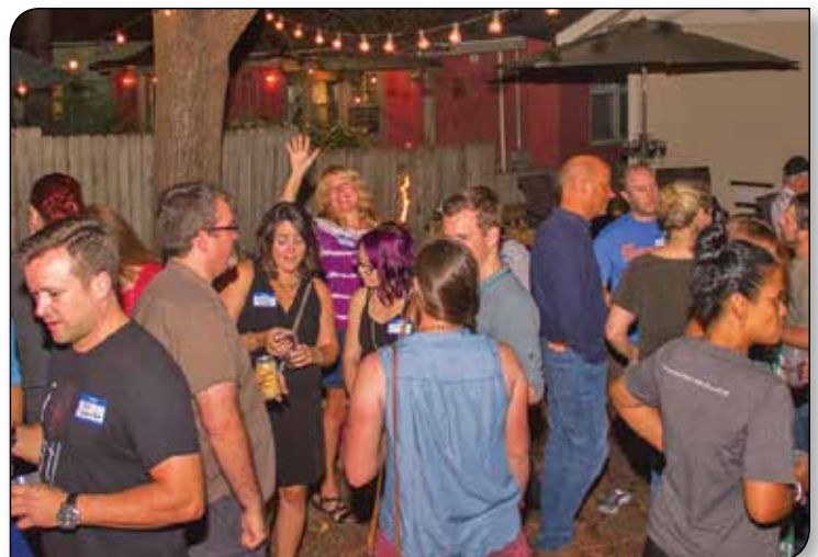
September 29 th , 2017.