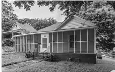
686 KIRKWOOD AVENUE