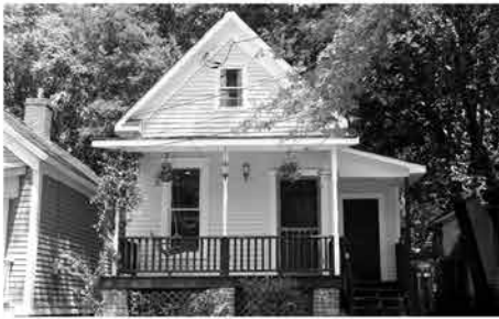
154 SAVANNAH STREET