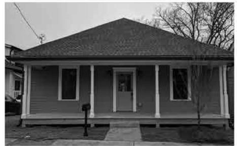
171 SAVANNAH STREET

THANK YOU, CABBAGETOWN, FOR A GREAT YEAR!