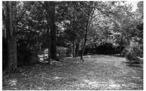
157 POWELL STREET