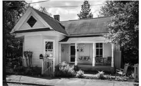
153 POWELL STREET