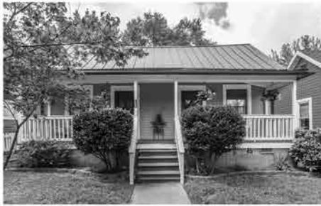
255 ISWALD STREET