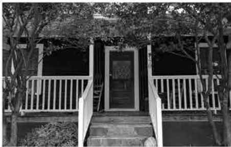
170 SAVANNAH STREET