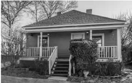
192 SAVANNAH STREET