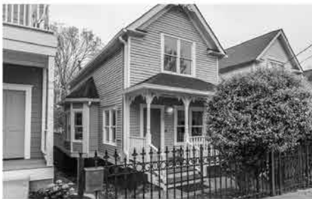
220 BEREAN AVENUE