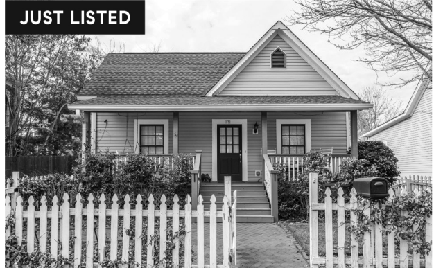
131 Short Street SE Just Listed for $699,000

We were thrilled to have the opportunity to help this previously listed house in Cabbagetown sell prior to us getting it back on the market. After consulting with the owner and making recommendations to help it show better, we handled all selections including paint colors, upgrading lighting, finishing details and final staging edits, and project managed the repairs and updates. Preparation is everything - let us show you how to make your house shine for the market!