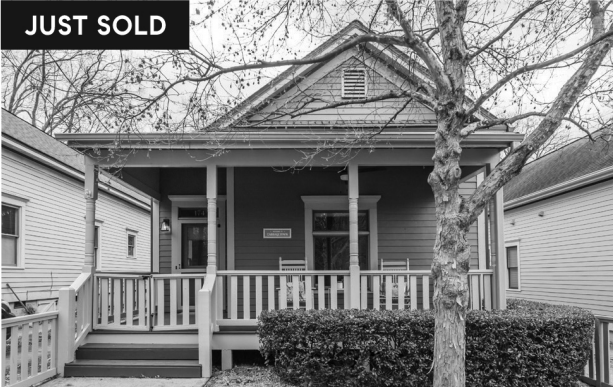
174 Estoria Street SE Just Sold for $569,000

chrissie kallio > Real Estate > simplified.