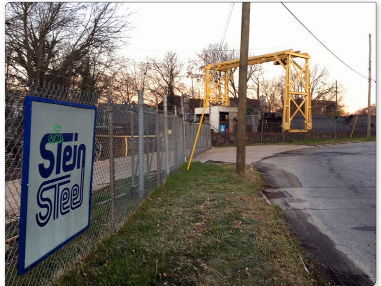
The Stein Steel yard on Flat Shoals Avenue in Reynoldstown

Per the listing, the site's potential density could exceed two million square feet – roughly the size of Ponce City Market . Stein Steel provided the structural framing for Atlanta Dairies's