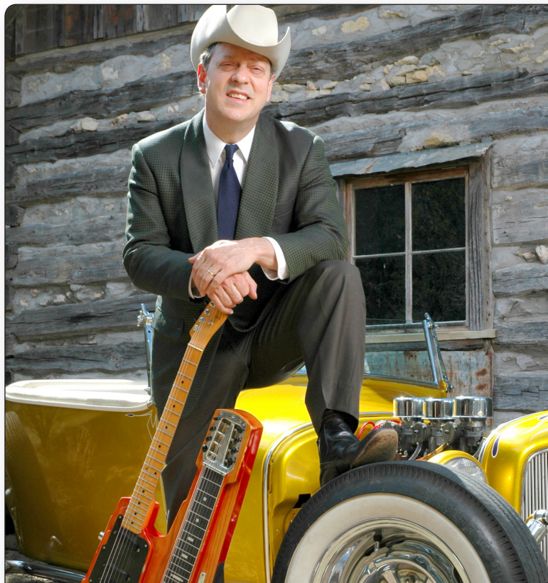
Monday, February 24 th • Junior Brown @ City Winery

Mon. Feb. 24 Junior Brown @ City Winery – The rompin' stompin' yang to Alan Jackson's mellow yin, guit-steel master Junior Brown proves that country music doesn't have to be pure vanilla. He can jump from an Ernest Tubb twanger to a BobWills two stepper in a heartbeat, then turn around and whip out a Ventures' instrumental that will wipe you out.