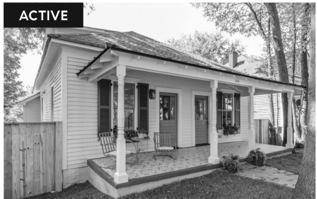
649 Gaskill Street SE Offered for $675,000